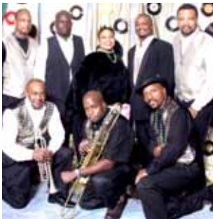
FIGURE EIGHT is noted for its fast paced and high energy show. Crowds love the quick-stepping choreography, and audience participation is natural for this band. Song list from the 50's to the 90's Marvin Gaye to Tim McGraw and from the Supremes to Brittany Spears to satisfy audiences of all ages. A tight rhythm section and hard driving vocals are what makes the group a Southeast favorite. Good Variety of songs and choreography are their trademarks $2000-$3000. The optional horn section makes for an incredible show that your guests will talk about for months. Mobile

When party and dance music is your goal, Accent is the act to have. Classic Motown to today's top hits, this band can satisfy a wide variety of audience demographics. Guitar, bass, drums, & keyboard player give a versatile backing to their wide songlist. Three of the guys sing, and then there is the diva. She is the "icing on the cake". $2-2500 depending on date and routing. Intense and dynamic show.